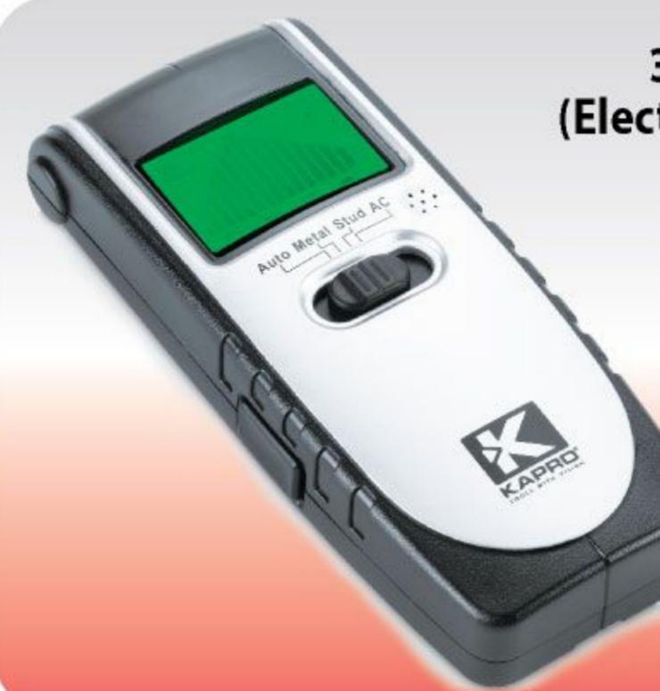
389 Multiscanner Stud Finder (Electronic Cable, Metal & Stud Sensor)