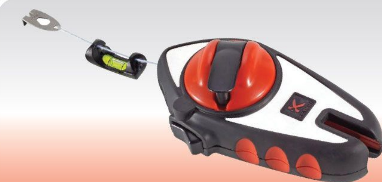
215 Stainless Steel Layout and Marking Chalk Line