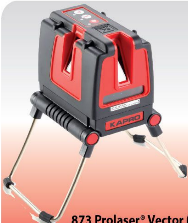
873 Prolaser® Vector (Laser level)