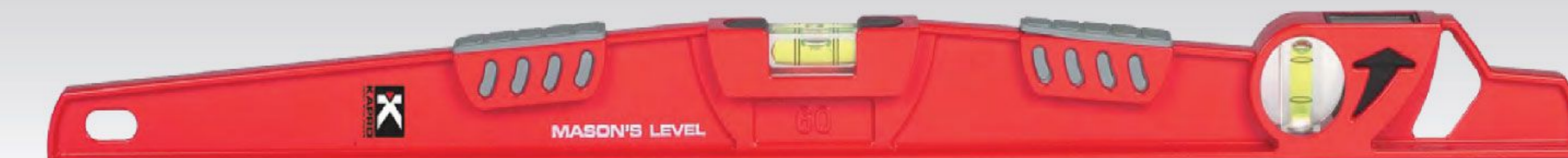
920 SHARK® (The Ultimate Mason's Level)