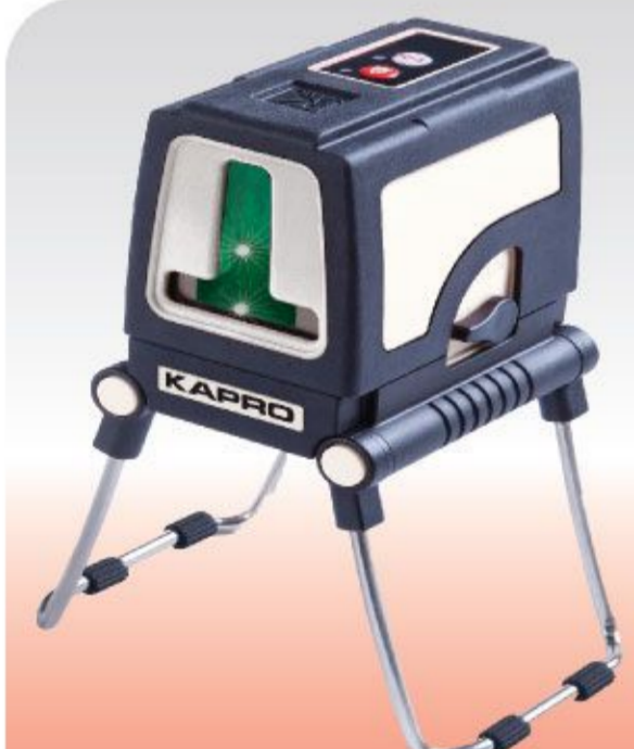
872G Prolaser® Green (Laser level Green, The Free Standing Cross-Beam Laser)