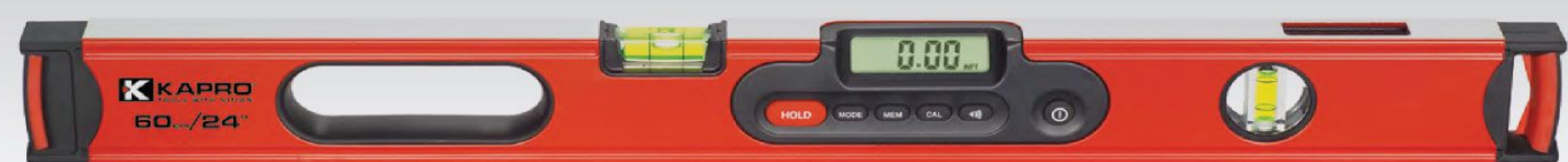
985D DIGIMAN™ (Professional Magnetic Digital Box Level)