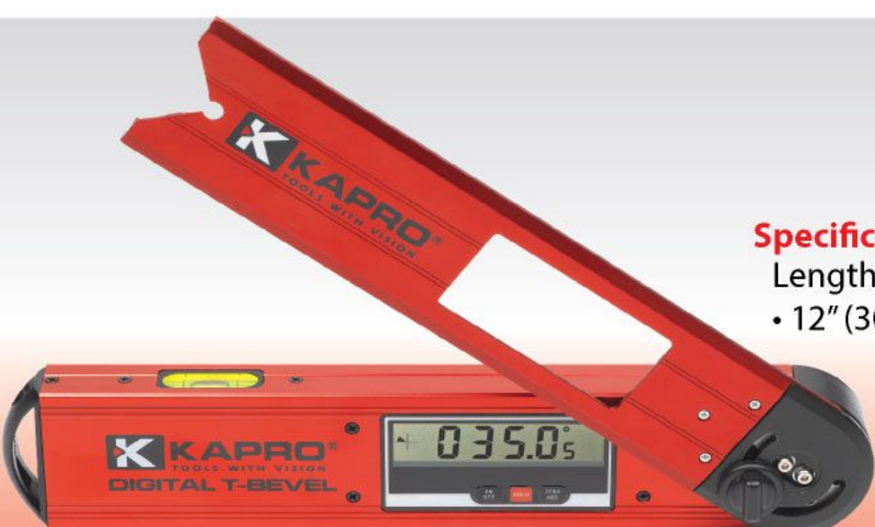
992 Digital T-Level (Precise angle Measurer and Level)

Lengths: • 10" (25cm) • 24" (60cm) • 48" (120cm)