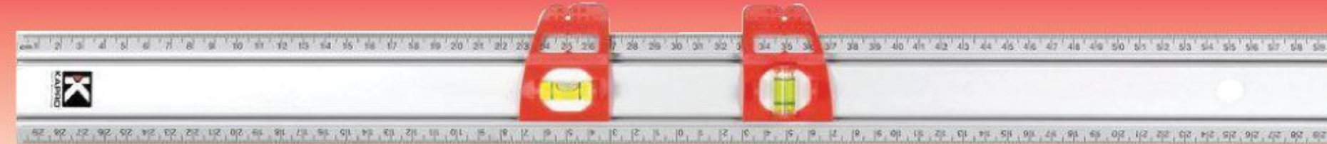
314-03 Ruler for Marking With Level