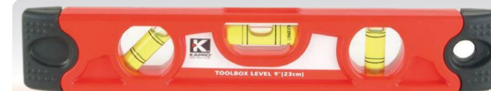
227 Toolbox Level 9" (23cm)