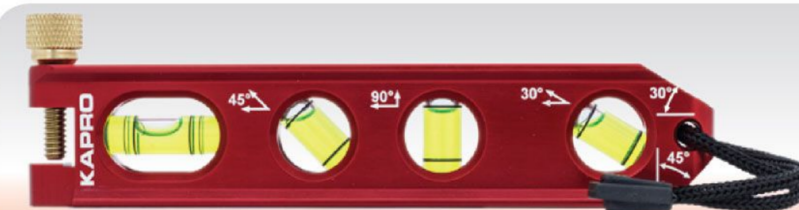
926 Pipemaster (CONDUIT PIPES LEVEL 16.6cm/6.5")