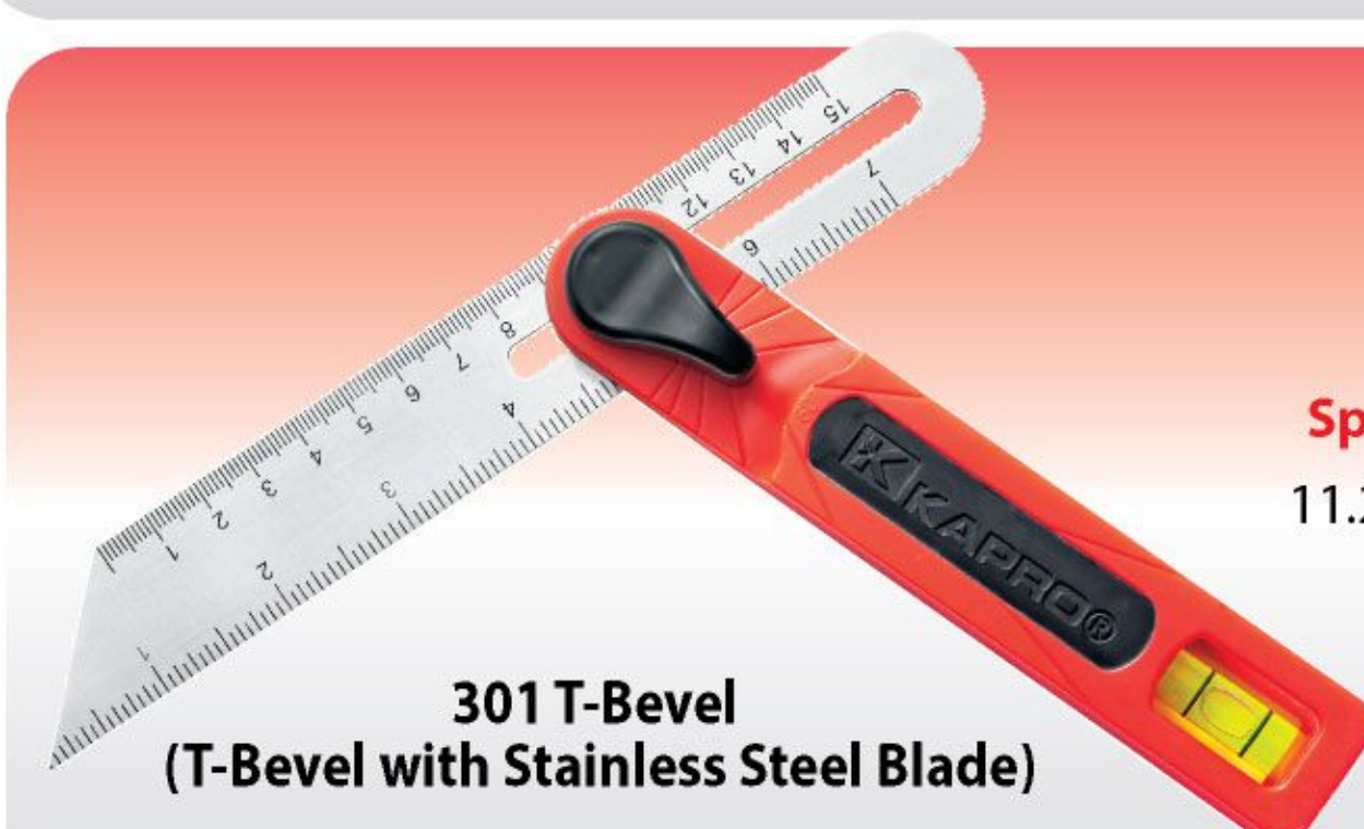
301 T-Bevel (T-Bevel with Stainless Steel Blade)