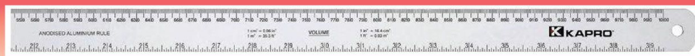
306 Aluminum Ruler with Conversion Tables (Aluminum Ruler)