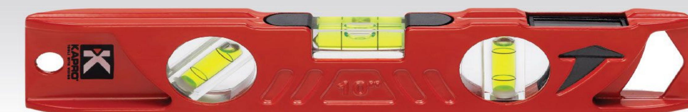
923 Cast Toolbox Level 25cm (10")