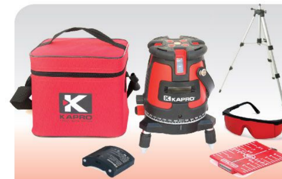
875 Prolaser® Layout Set With Soft Bag (Survey Level with Laser + Lithium Battery)