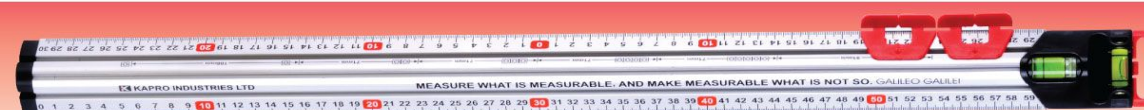
313 Measure Mate (Ruler Measure Mate)