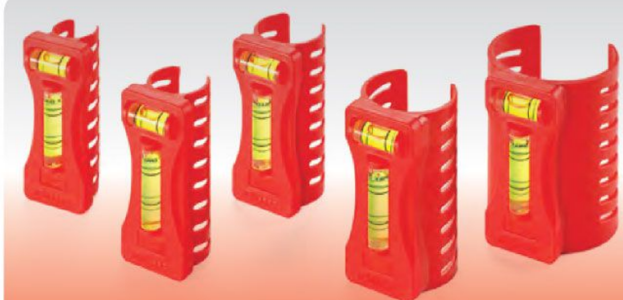
350 Pipe Level Set (5 Pcs pipe level set)