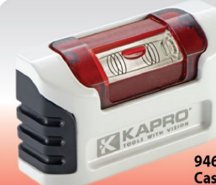
946 Smarty OPTIVISION™ Red (Magnetic Cast aluminum level 10cm /3.9")