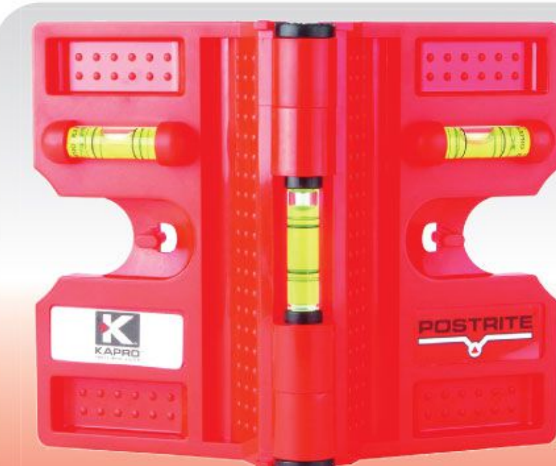
340 POSTRITE® (Folding Post Level)