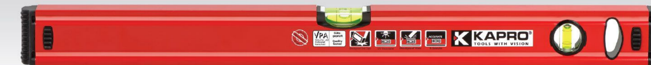
779-40M Spirit™ Quality Box Level (Spirit Level Magnetic)