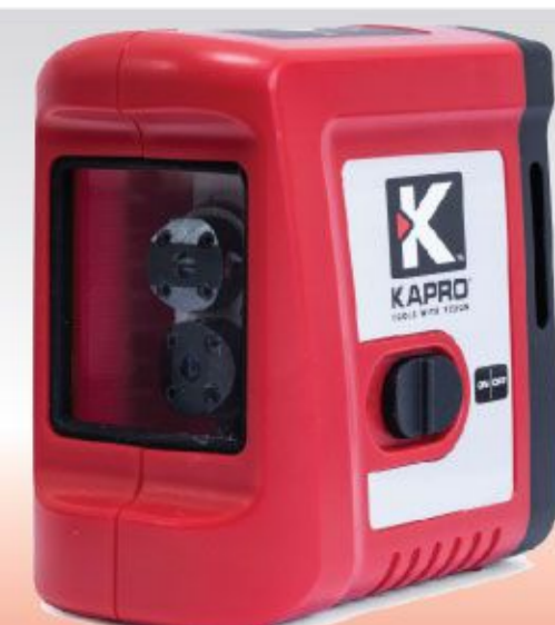
862 Mini Cross Line Laser (Survey Level with Laser + Bracket)