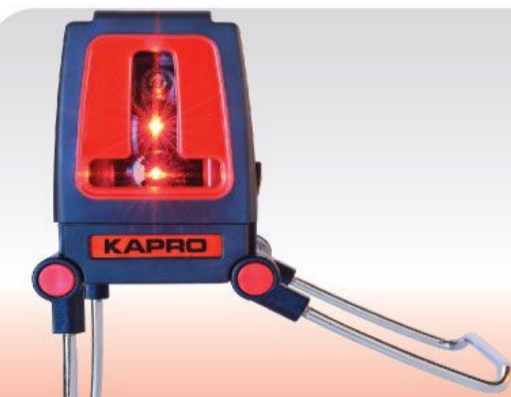
872 Prolaser® Plus Red (Laser level Red, The Free Standing Cross-Beam Laser)