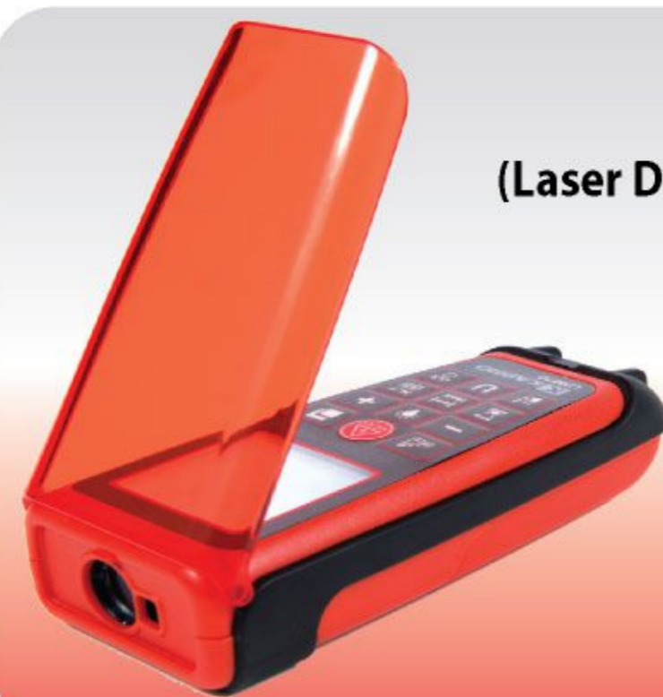
375 Kaprometer K5 (Laser Distance Measurer with Beamfinder™)