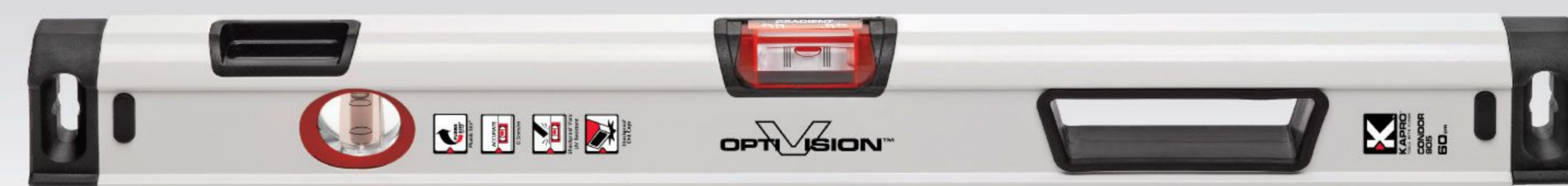
905 Condor (Spirit Level, Red Vial, Heavy, Magnetic with OPTIVISION)