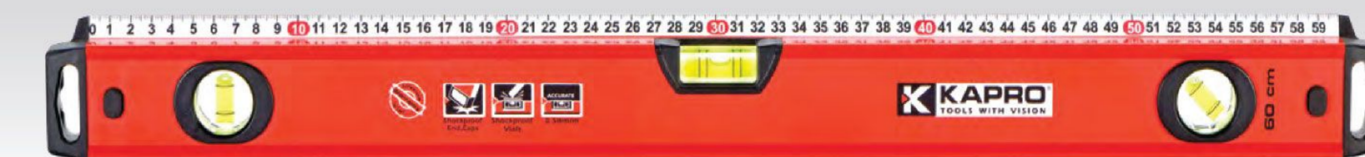
770 Exodus Professional Box Level with Ruler and Straight Edge (Spirit Level with Scale)